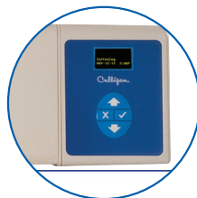
Culligan® HE SOFTENER display