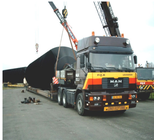
Off loading of an Archimedean screw

Our own in house SHE officer covers the requirements of working to the UKs stringent Health Safety & Environmental requirements with all site staff trained to high levels for Site Safety, including Confined Space Working, CSCS Certified, Slinger Banksmen etc we also have several Crane Lift Appointed persons for planning of lifting operations in house. Our company is UVDB registered and Achilles certified – a requirement for most reputable UK companies.