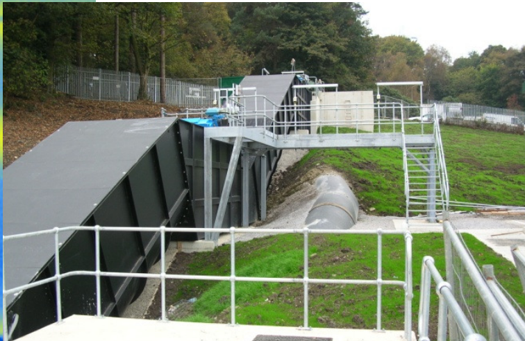
180kW Screw generator in two stage configuration

Utilising our own specialist plant including our own Crane, Robotic machines and equipment we can offer very competitive solutions from "Supply Only" to full "Turn Key Solutions" including Civil works, Electrical Installation and Control for all sizes of Screw Hydro sites. We can offer a 24 hour callout service. We carry extensive stocks of standard spares at our facilities which are centrally located in the UK.