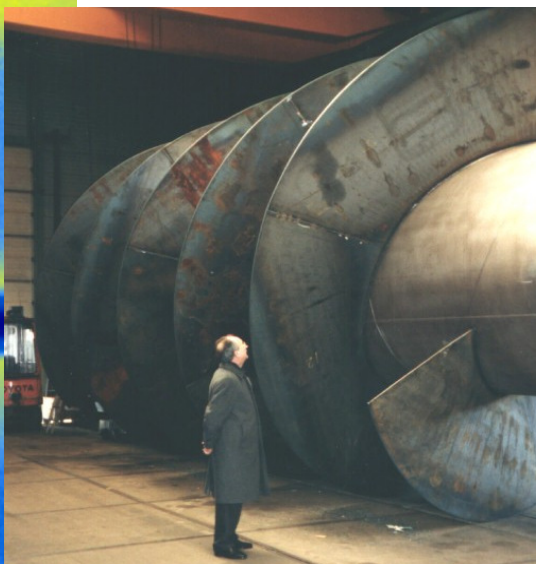
Fabrication of a large screw

We have specially designed environmentally friendly bearings along with a submersible drive train arrangement for coping with flood conditions that can exist on many rivers. Using an epoxy coating developed for offshore applications factory applied in our own works we can provide equipment protected against corrosion and wear for very arduous duties. We have reference lists detailing thousands of screws supplied world wide many of which are over 30 years old, some older than 40 years and still in use today.