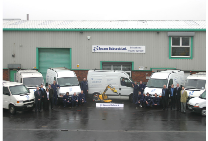
Spaans Babcock Ltd

With a total project payback period within 6 years in some cases, we offer a high quality long lifetime product at very competitive rates.